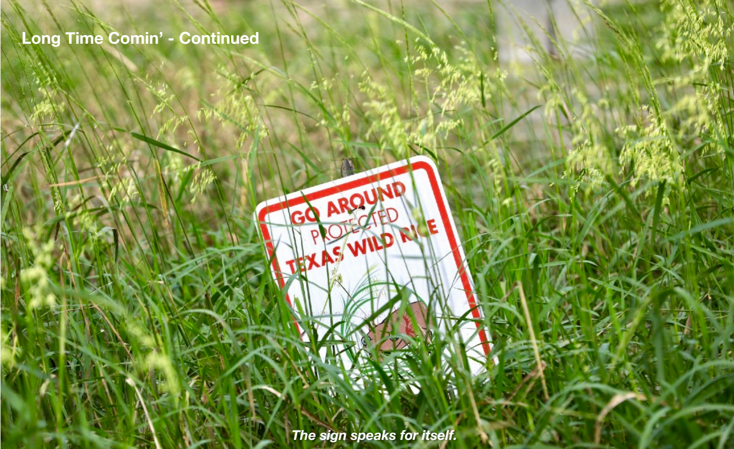
The sign speaks for itself.