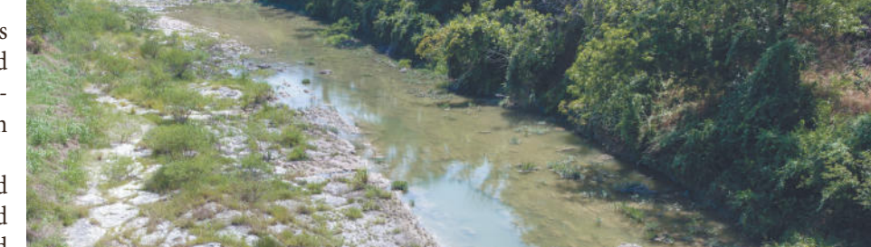
The Alliance sees waste- The low-flowing Guadalupe River is pictured from FM 311 near Spring Branch on June 28, 2024. Surface water and groundwater are closely linked in Comal County.