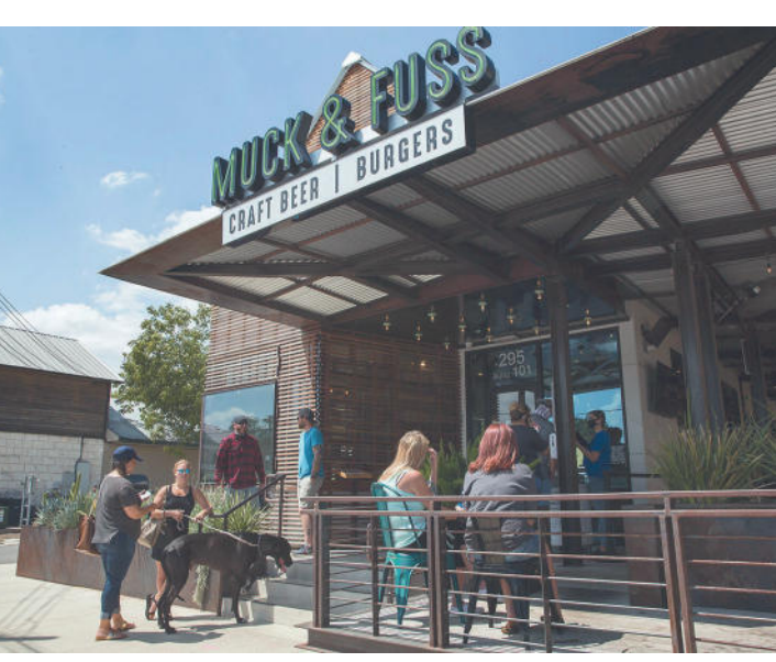
The original Muck & Fuss location is shown at 295 East San Antonio

See EXPANSION , page 3A Street in New Braunfels.