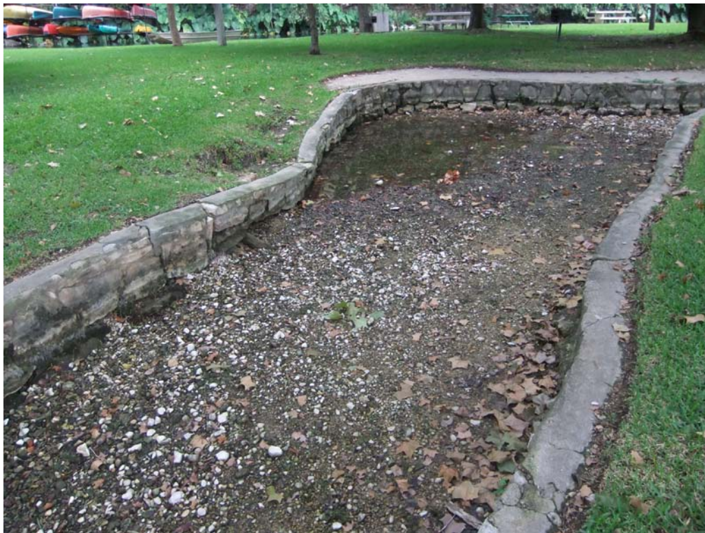
Figure 5: Mostly dry southern spring run on Spring Island

gone subsurface (Figure 5). It was encouraging that Comal Springs salamanders were still documented in the Spring Island eastern outfall area at typical concentrations during the August 16 th survey. As noted, additional biological monitoring activities conducted in the Spring Island area include the placement of cotton lures at 10 sites within the Spring Island upwellings for Comal Springs riffle beetles. The lures will be retrieved next week and results presented after that time.