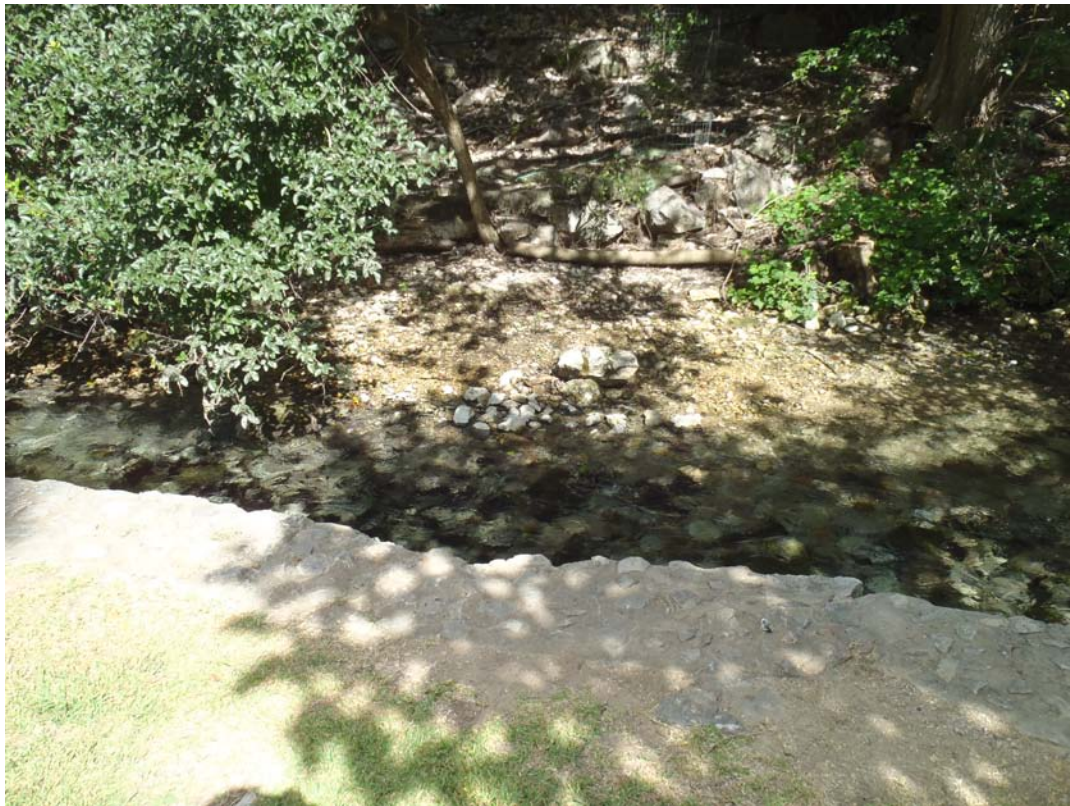
Figure 3: Spring Run 3 – constriction in mid run and exposed area (August 21 st )