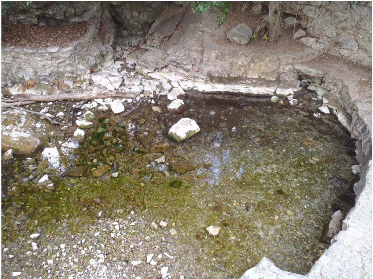
Figure 1: Spring Run 1 orifice (August 21 st )

As evident in both sets of measurements, the main spring runs (1, 2, and 3) are getting quite low. This is very evident in Figures 1 through 3 below. In fact, the larger spring openings at the head of Spring Run 1 have ceased surface flow (Figure 1) which has not been observed since the initiation of the biological monitoring effort in Fall 2000.