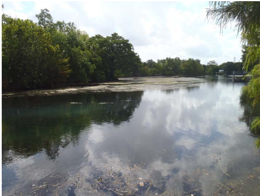
Figure 10: Fountain darter in within Scuba transect in Landa Lake.

Although habitat conditions within the lake are holding steady, water levels are low and floating mats of aquatic vegetation are becoming more evident (Figure 10). If allowed to be stagnant for too long, these mats will shade out underlying vegetation. They are also popular hangout zones for large predators (Figure 11).