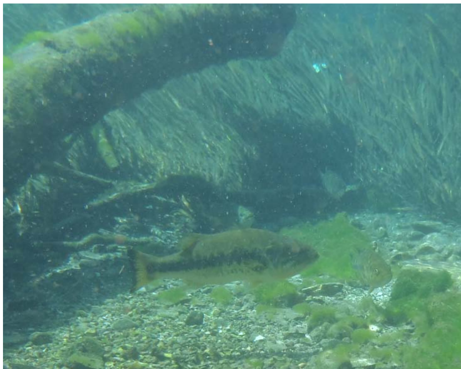
Figure 11: Largemouth bass under floating mat of aquatic vegetation