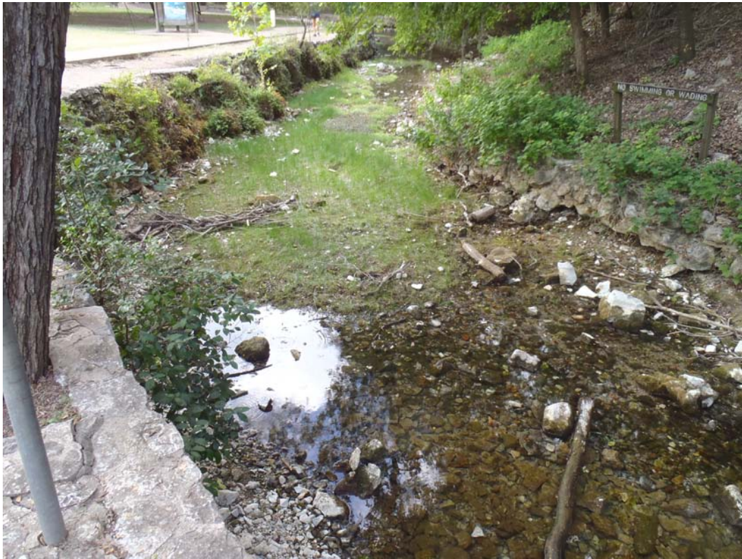
Figure 2: Just downstream of Spring Run 1 orifice (August 21 st )