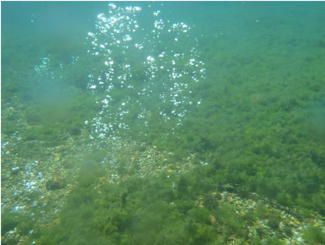
Figure 6: Abundant bryophytes and upwelling flow within Landa Lake.