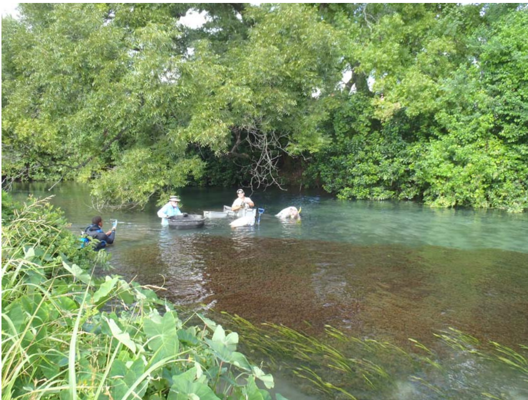
Figure 7: Restored Ludwigia area in the Old Channel