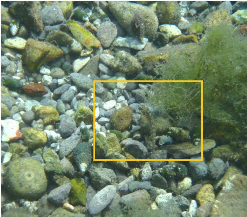
Figure 9: Fountain darter within Scuba transect in Landa Lake.